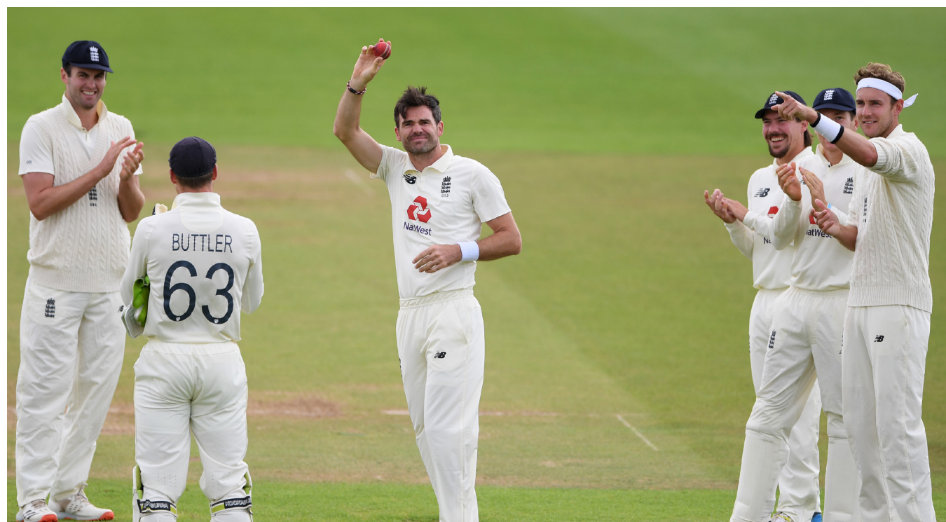
ABOVE: Anderson acknowledges the crowd after claiming his 600th Test wicket – that of Pakistan’s Azhar Ali – in August 2020

man, Virat Kohli. He nicked his first ball. Trent Bridge went nuts.