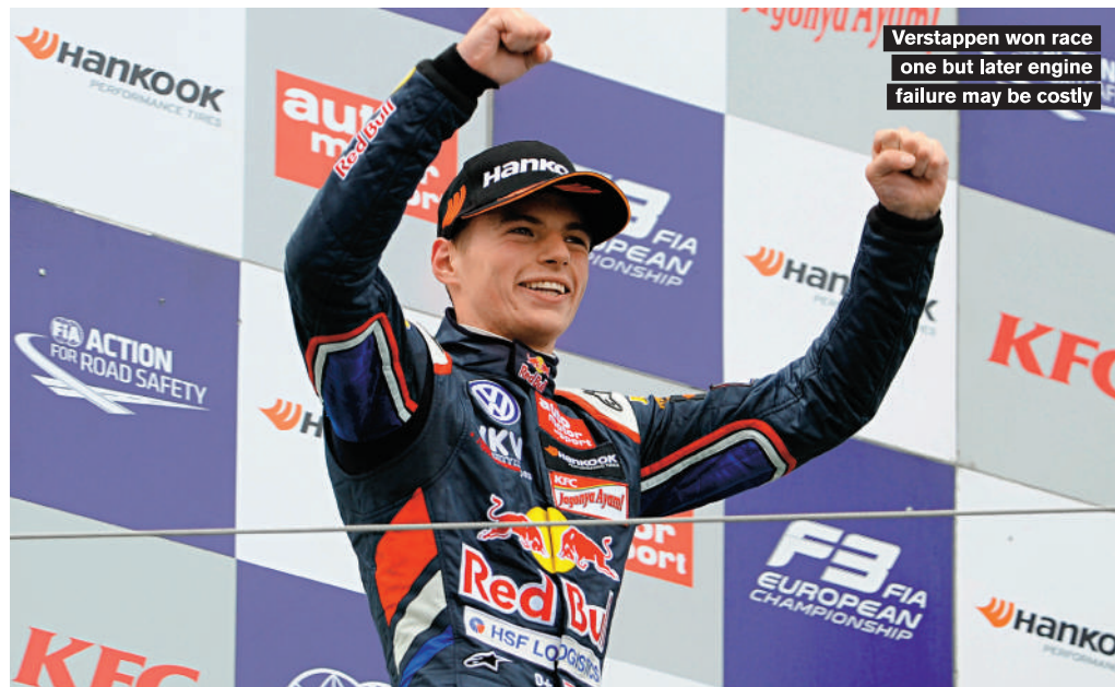
Verstappen won race one but later engine failure may be costly