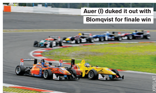
Auer (I) duked it out with Blomqvist for finale win

Ultimately it was that damp race-one drive that earned Verstappen his little bite out of Ocon's lead last weekend. Overcoming a 77-point deficit when he'll start two of the last six races no higher than 11th is a huge ask. But never say never in this series: there could be more twists to come.